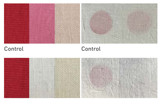
Control Control With BeSo®LASTING With BeSo®LASTING Colour fastness results: contact and rubbing fastness